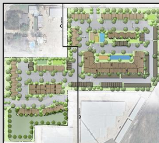
Multifamily Land Dallas, TX