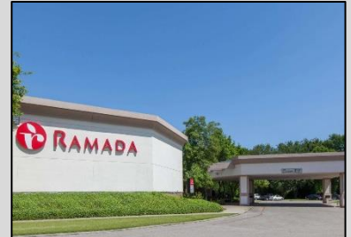
Acadian Crossing Lafayette, LA

Conversion of a 160-Key Hotel to Apartments & a 34-Unit Stabilized Apartment Asset