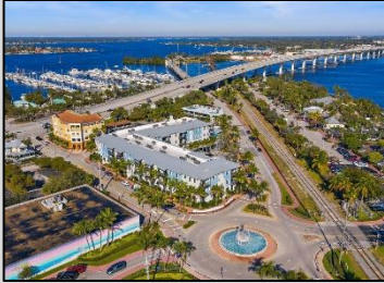
Azul Luxury Residences Stuart, FL