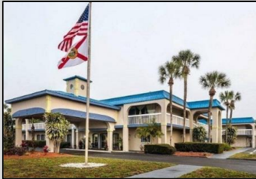
Hotel To Multifamily Conversion Tampa, FL

Conversion of a 115-Key Extended Stay Hotel to Apartments