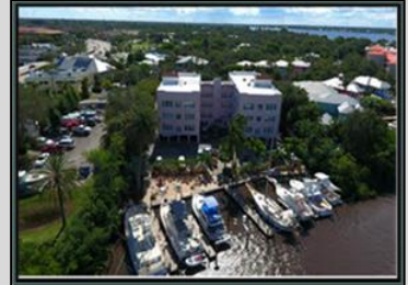
France Apartments Stuart, FL

Acquisition & Renovation Loan 58-Unit Value Add