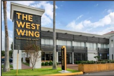
West Wing Apartments Tampa, FL