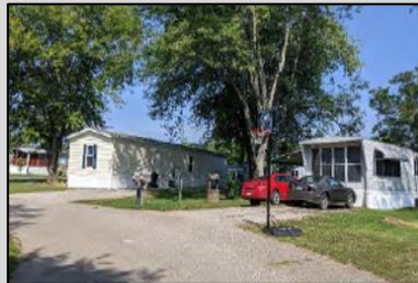
Mobile Home Communities Zanesville, OH

Acquisition and Renovation of Three MHCs