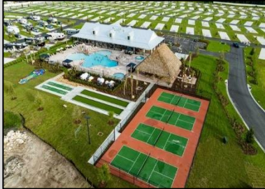
Luxury RV Park Ocala, FL