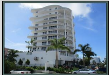
Luxury Condominium Project Ft. Lauderdale, FL