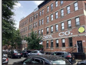
Multifamily Refinance Brooklyn, NY

482-Pad Luxury RV Park Refinance and Bridge to Sale