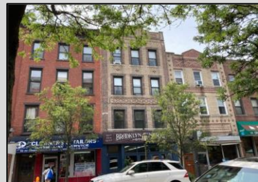
Union Street Multi Brooklyn, NY

Portfolio Acquisition Loan Value Add Multifamily