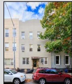
Multifamily Renovation Brooklyn NY

Recap of a 224-unit Multifamily Townhome Development Site