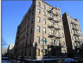
Value Add Multifamily Brooklyn, NY

Acquisition Loan 49-Unit Class A Multifamily