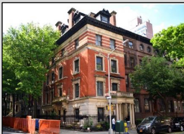
Upper West Side New York City

Conversion of a 244-key hotel to 216 Apartments