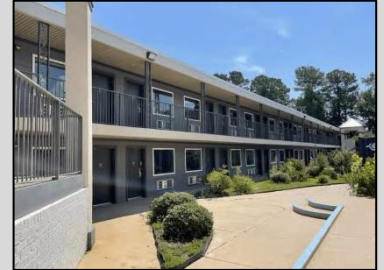
Hotel to Multi Conversion Wilmington, NC

Refinance of a 63-Unit Multifamily Property