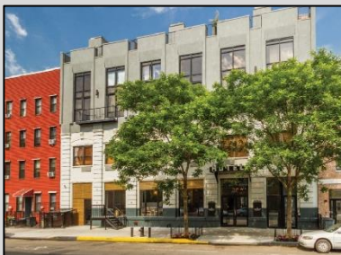
Hospitality Recapitalization Brooklyn, NY

Recap and Conversion of a 120- Room Hotel to Multifamily