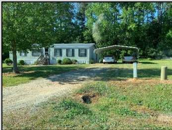
Mobile Home Communities Rocky Mount, NC

Acquisition and Renovation of a 30-Unit Multifamily Project